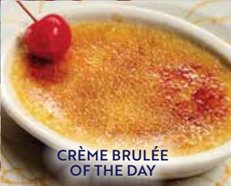
CRÈME BRULÉE OF THE DAY