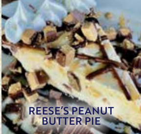
REESE’S PEANUT BUTTER PIE